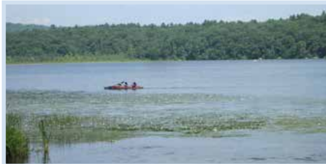
Ponkapoag Pond is one of two kettle holes in the Blue Hills.

In addition to the local groundwater levels, there may be some spring water entering the ponds via fractures in the underlying bedrock. The depths of kettle ponds range from a few feet to tens of feet. Ponds, such as Houghton's and Ponkapoag, are about 15 to 40 feet deep, while Walden Pond is just shy of 100 feet.