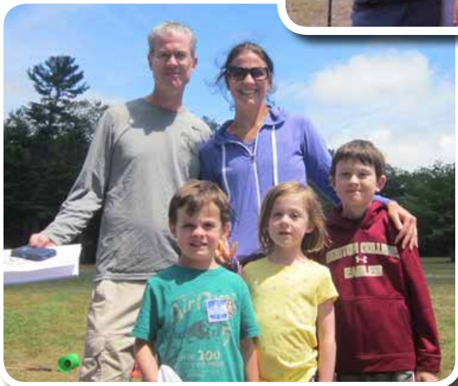
The Day family from Roslindale enjoyed fishing and the crafts!