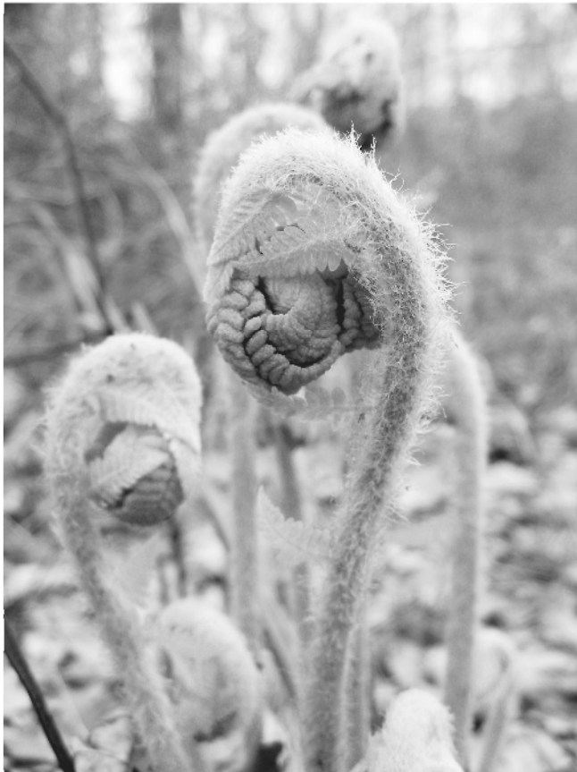
2011 Photo Contest entry by Kerri Dailey of Quincy

Enjoy all the photo finalists and vote for your favorite! www.FriendsoftheBlueHills.org/photofinalists