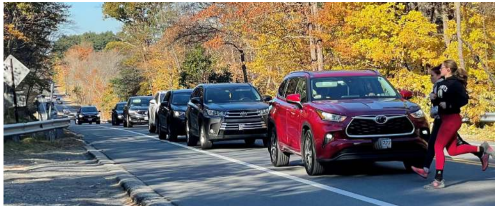
Hikers sprint across Route 28 as they follow the Skyline Trail. The Friends of the Blue Hills successfully advocated for a study to recommend safety improvements to this hazardous crossing.

Thanks to the urging of members of the Friends, the Boston Region Metropolitan Planning Organization has agreed to perform the study this fiscal year.