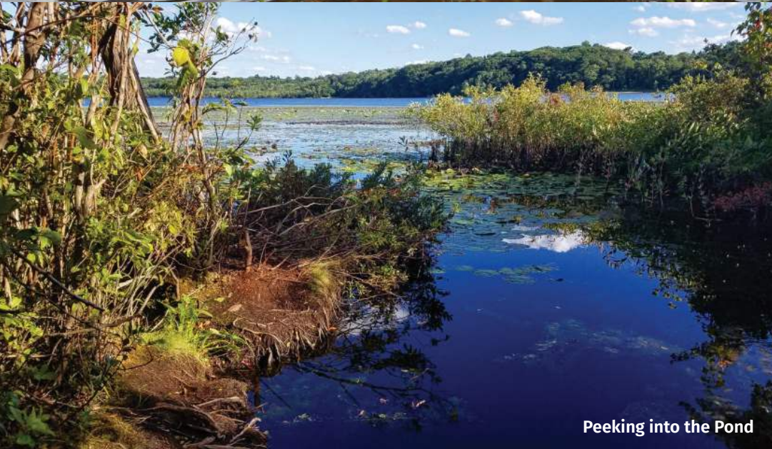
Peeking into the Pond