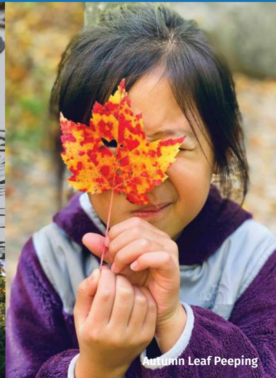
Autumn Leaf Peeping