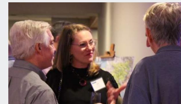
Members mingle in front of the online auction display