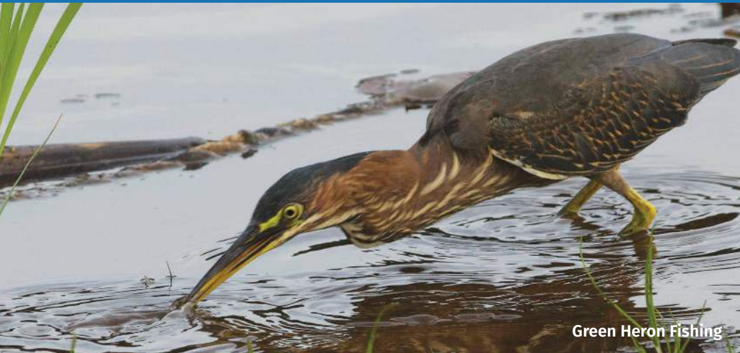
Green Heron Fishing