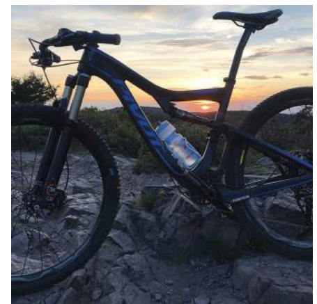
Emerson Dobrindt, Milton, Night Mountain Bike Ride

Watch our website for more info on upcoming events and these projects. We will need your help to make progress.