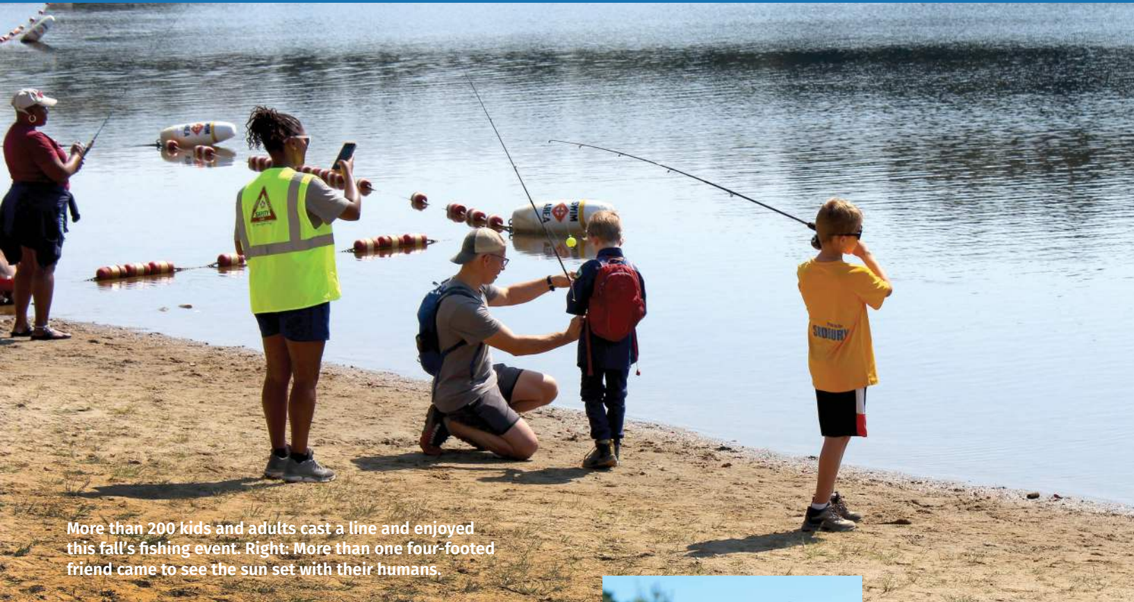
More than 200 kids and adults cast a line and enjoyed this fall's fishing event. Right: More than one four-footed friend came to see the sun set with their humans.